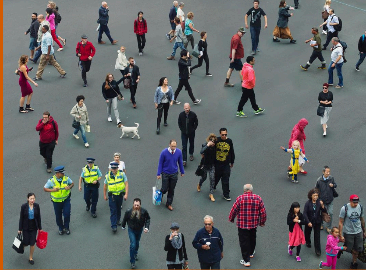
Reference image: Ben Zank

These large format images will be exhibited online and at theatres, and where possible, projected onto the outside of the venue.